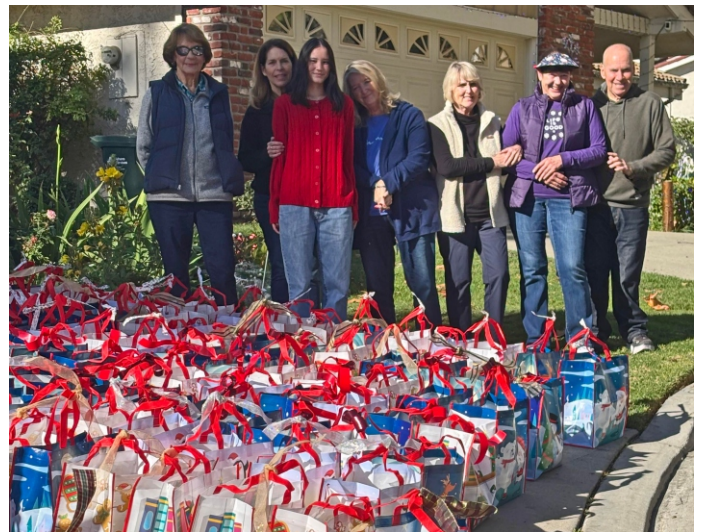
Thousand Oaks Lodge 2477 Lodge Volunteers filled 200 gift bags for Oasis, a meal delivery company, to hand out to seniors during the holidays. They delivered to seniors who they take to doctor visits and the like, for cities in Ventura County.