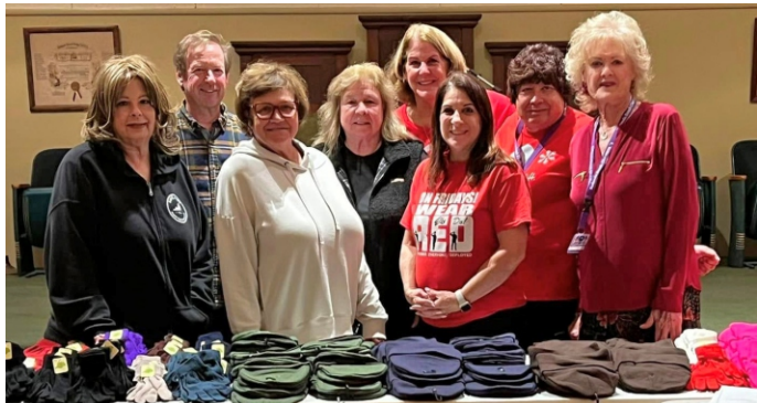
Redondo Beach Lodge 1378 Veterans Committee used Gratitude Grant money and purchased hygiene products, knitted beanies, and gloves for 100 Veterans. They were distributed to residents at the West Los Angeles VA. Pictured are members of the Redondo Beach Lodge's Veteran's Committee.