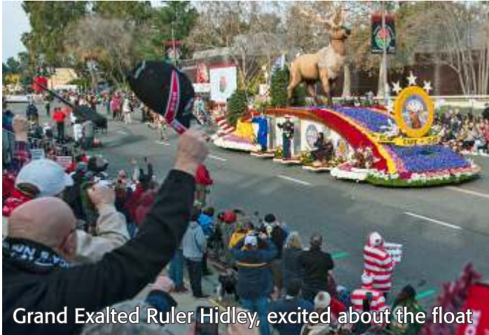
Grand Exalted Ruler Hidley, excited about the float