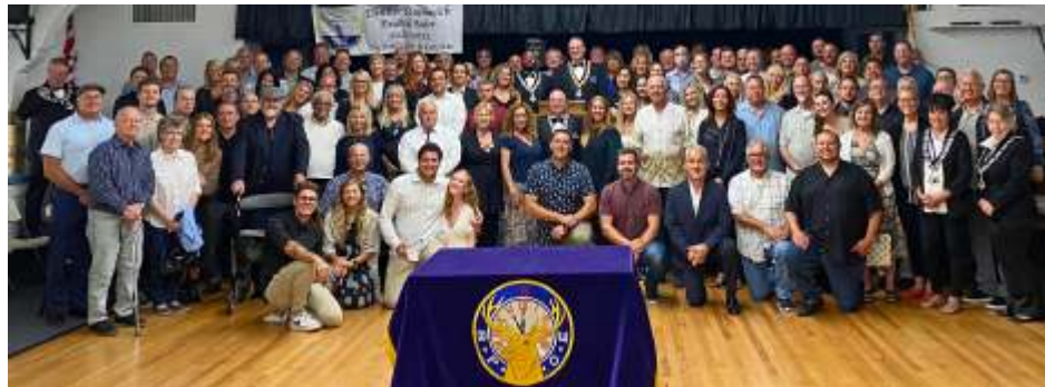
Newport Harbor Lodge 1767 makes history in September with its second Initiation class of over one hundred initiates in one month.