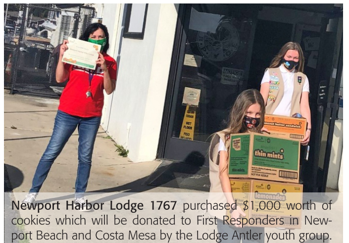
Newport Harbor Lodge 1767 purchased $1,000 worth of cookies which will be donated to First Responders in Newport Beach and Costa Mesa by the Lodge Antler youth group.