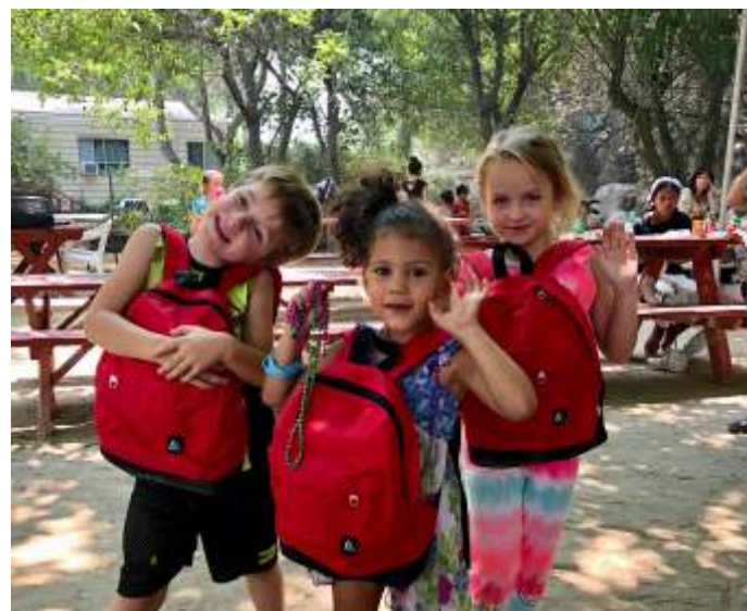
Kern River Valley Lodge 2358 , using a Promise Grant, Lodge members distributed 150 backpacks filled with school supplies and Drug Awareness pamphlets at their annual Kids Carnival. Lodge members staffed arcade games and also fed the children lunch.