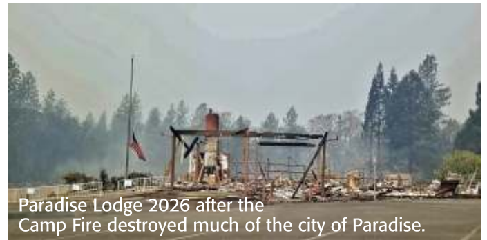
Paradise Lodge 2026 after the Camp Fire destroyed much of the city of Paradise.