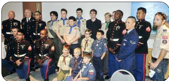
Scout servers with Marine Corps and Air Force greeters