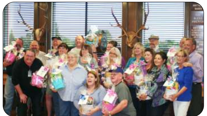
The "Wildcard Army"

When the Elks find out about events like these, we get involved, and the saying "Elks Care and Elks Share" makes you proud that you are an Elk!