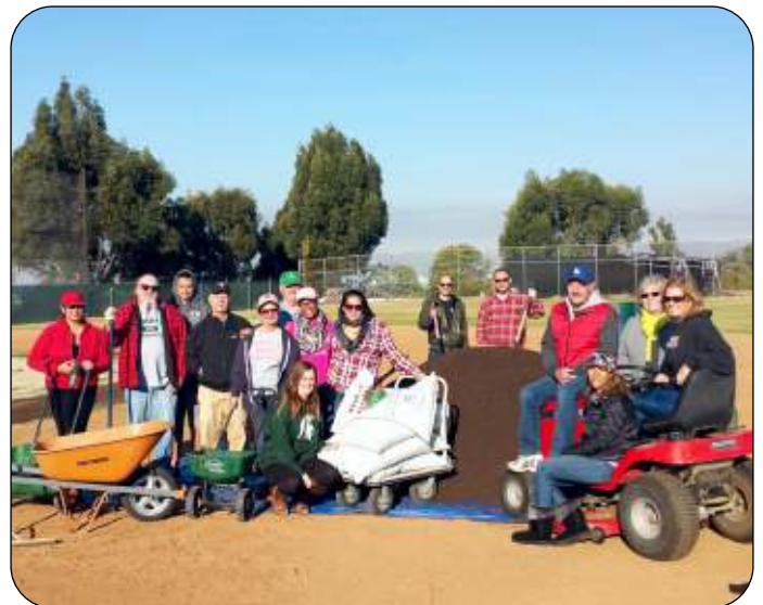
Lodge members helping with the reseedling

In other news, the Lodge donated Cheesecake Factory gift cards worth $200 to pay for dinner for the band that played at the Wadsworth Theater's "Miracles for Heroes Concert" performance at the VA in West Los Angeles in February. Lastly, several Lodge members sold Girl Scout Cookies on behalf of Troop 545, generating $200 for the troop.