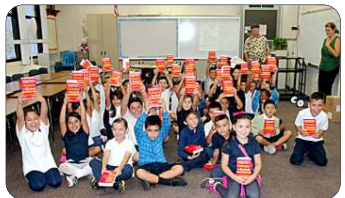
Rancho Nacion Elementary School, National City, CA