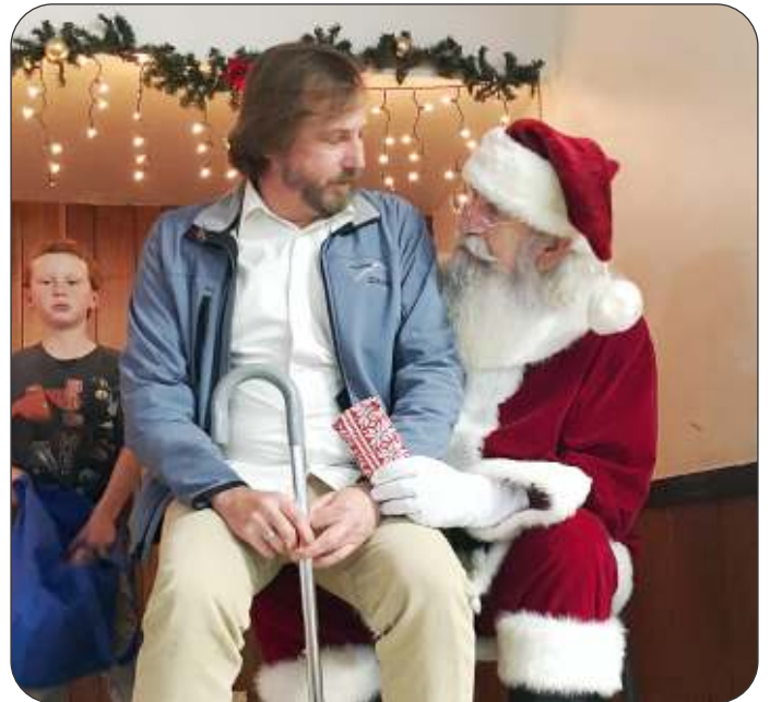
A veteran talks to Santa