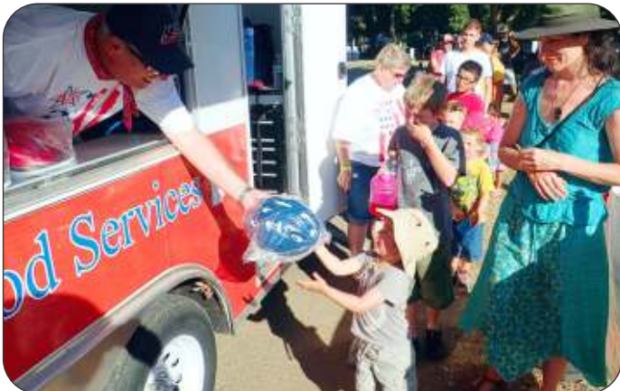
A child receives a free bicycle helmet