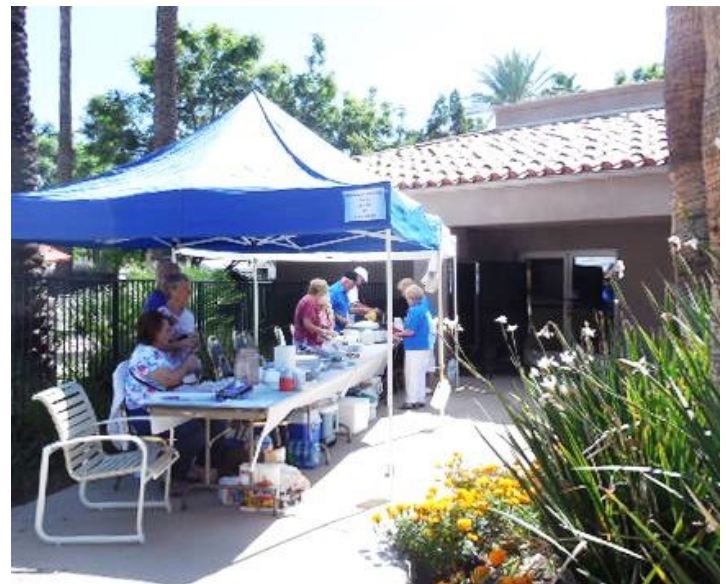
Ribs, Tacos, Brats, Hamburgers and Beverages