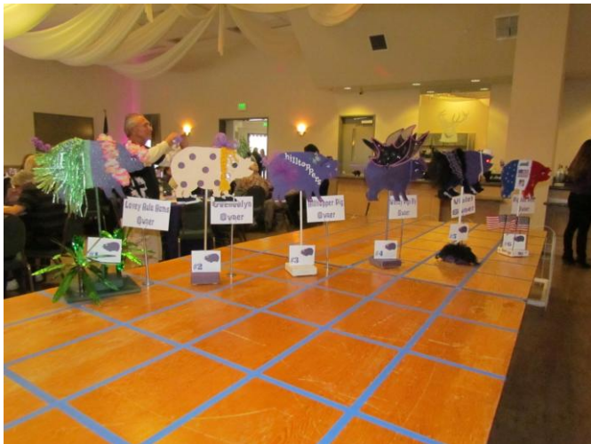
The Pigs: Lovely Hula hams, Gwendolyn, Hilltopper Pig, Wendy Pigs Fly, Violet Pig, and Pigaloe Pete

On Sunday, January 26 th , the Fullerton Elks Lodge held their first pig races and everyone who attended had a great time. The pulled pork sandwiches and sides were donated by The Bourbon Street Restaurant. Prizes and gift baskets were donated by Lodge members and friends. The Pigs: Lovely Hula hams, Gwendolyn, Hill Topper Pig, Wendy Pigs Fly, Violet Pig, and Pigaloe Pete, were tastefully customized by members and then sold at an auction. The winners were awarded prizes. The Fullerton Elks raised over $4,600 for the Major Project during this event.