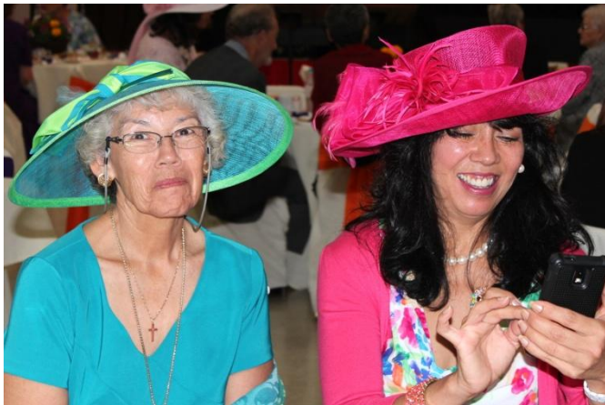
Ladies From the Chula Vista Victorian Society