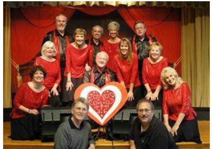
More Rhapsody Singers