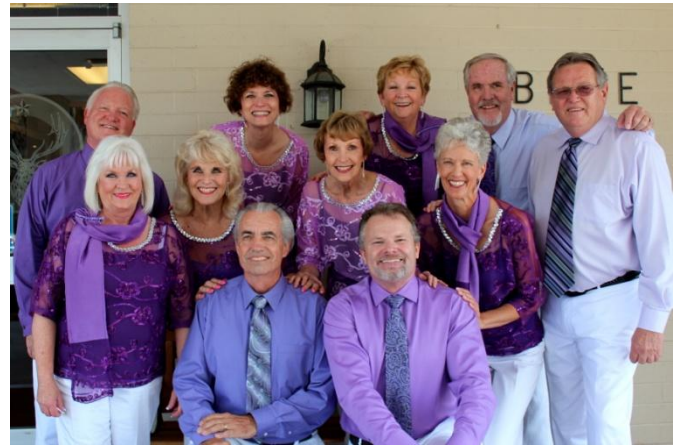
The Rhapsody Singers