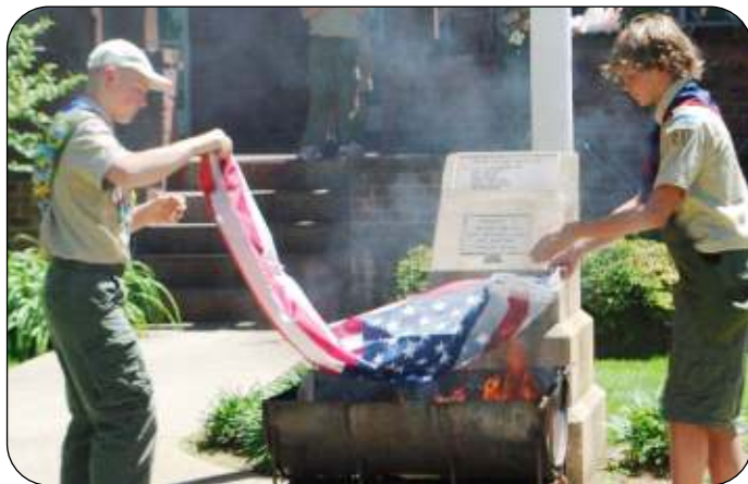
Boy Scout Troop No. 21 retires an American Flag

A lunch was served by the Scouts and the Lady Elks after the Flag Day ceremony and prior to the flag retirement. During the lunch, the Lodge recognized the many veterans who were present for the event. Also in attendance, and with a special recognition, were several Blue Star Mothers.