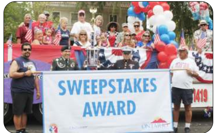
Lodge members look on proudly from the float - the "Sweepstakes" trophy is visible behind the banner.

This honor was greatly appreciated by all the workers who designed and decorated the float. It was an opportunity for them to have some fun while promoting the B.P.O. Elks to the community members who lined the street to view the parade.