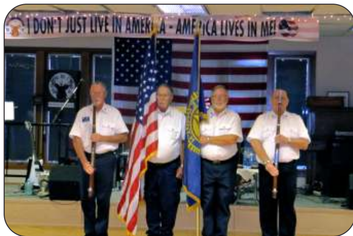
Color Guard from the American Legion Escondido Post No. 149