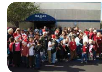
Children await the arrival of Santa Claus.