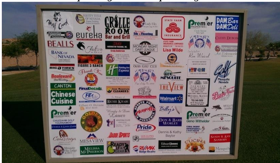
Sample of sign from Mesquite Lodge 2811